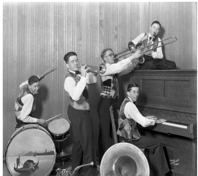
January image: Natrona CHS Pep Orchestra in 1931.

Or, Society Headquarters at linda@wyshs.org