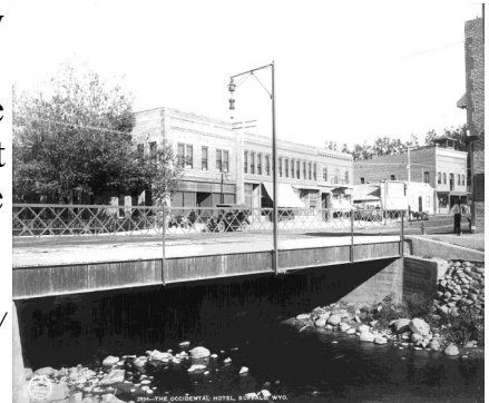
The historic Occidental Hotel