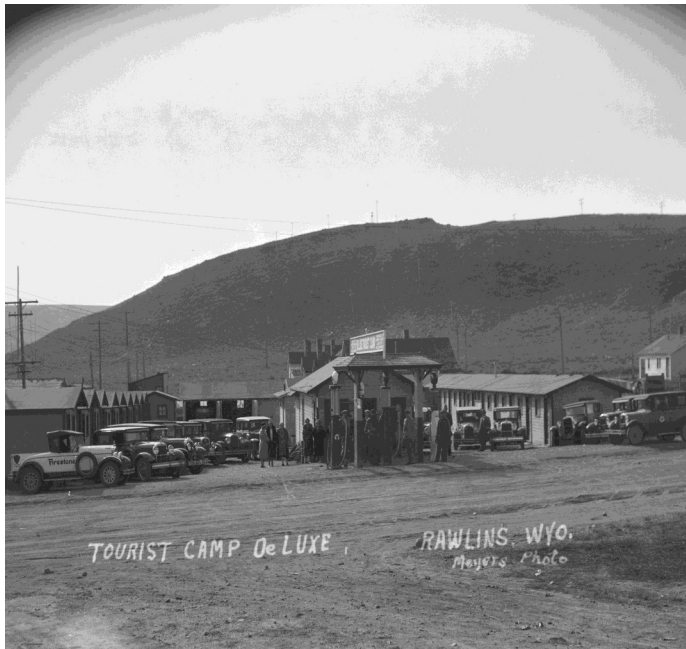
The Deluxe Tourist Camp at Rawlins, Wyoming 1920. From the Frank J. Meyers Papers. 1921. Photo courtesy of the AHC.

Historical photographs from the collections of the American Heritage Center are once again featured in the Society's annual Calendar of Wyoming History. Each image is a visual reminder of how families and communities lived and worked in the early days. A fascinating "this day in history" tidbit is included on every day of the year. For instance, on October 11 in 1952 a 1,400 lb. bear was killed near Buffalo. Another favorite is on October 31, 1890 when a local butcher at Merino was arrested for stealing cattle!